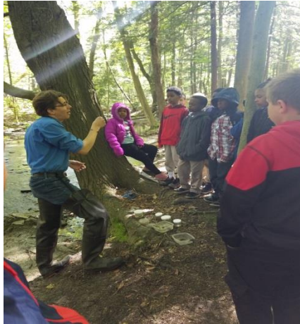
Fourth Graders at the Erie Conservation District

We have been very busy during the fourth quarter.